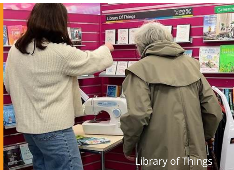
Library of Things

402 items were loaned saving borrowers around £32,000 and 14.7 tonnes CO2e was avoided compared with buying new.