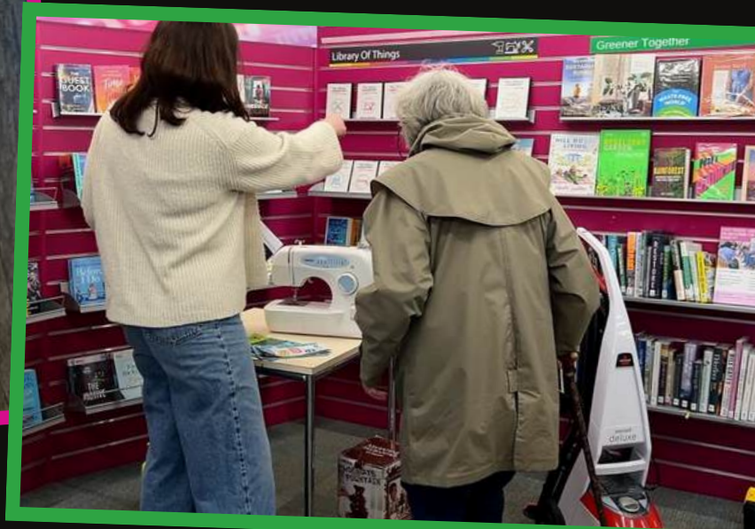
Library of Things

“ I am encouraged that you are leading the way! A great opportunity for libraries to act as educators ”