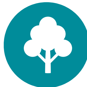
GROWING & NATURE