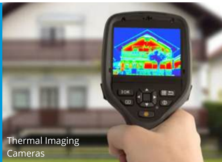
Thermal Imaging Cameras

Libraries in the Forest of Dean are trialling the hire of thermal imaging cameras in partnership with Forest of Dean district council