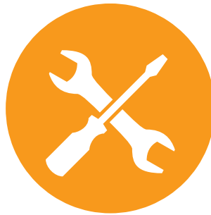
SHARE & REPAIR