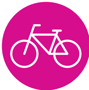
CYCLING & ACTIVE TRAVEL