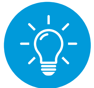
ENERGY SAVING & ADAPTATION