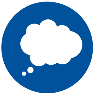
CREATIVITY & MINDFULNESS